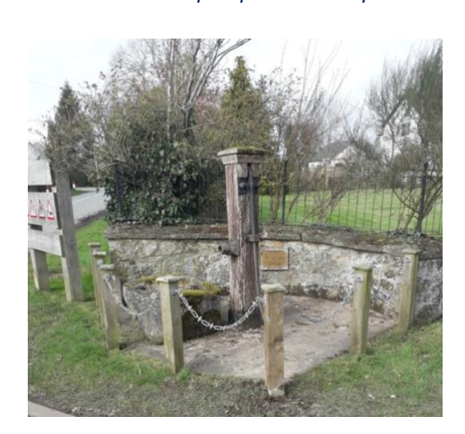
The old water pump at Aston Square

As a 'living' document this Plan will be regularly reviewed to show progress and ensure it is up to date.